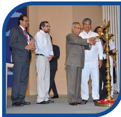
Efficient Water Management: Challenges and Opportunities