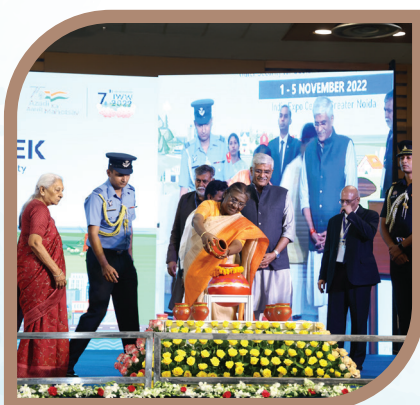
Water Security for Sustainable Development with Equity