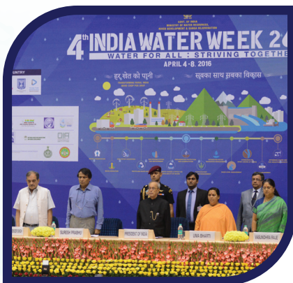
Water for All: Striving Together