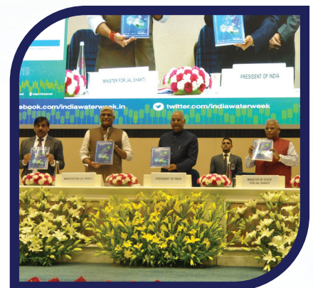
Water Cooperation – Coping with 21st Century Challenges