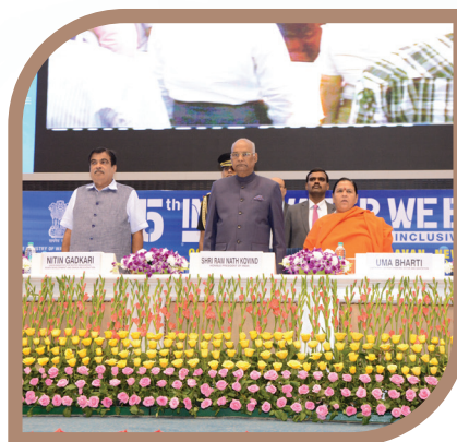
Water and Energy for Inclusive Growth