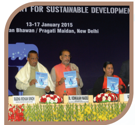
Water Management for Sustainable Development